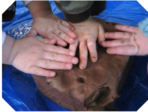
Providing real art materials such as paint and clay for children to explore