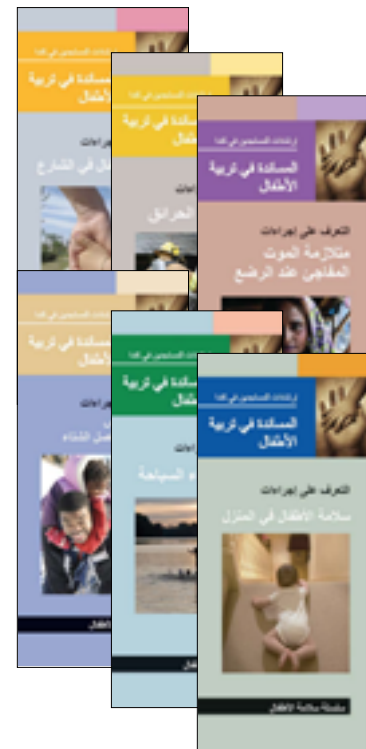
The New in Canada Parenting Support Child Safety Series—a series of newcomer-focused health and safety brochures that are available in 11 languages, including Arabic

Learning a few words in Arabic and having resources for your program will assist the team to understand needs, communicate with families and work with the children. Burnaby Public Library’s Embracing Diversity Project audio/videos provides great resources that can help you learn the words and pronunciation of Welcoming Phrases in Arabic , a list of 100 Common Arabic Words , and Arabic Songs . CMAS has also created a helpful tip sheet of 15 Arabic Words that you can use in your program.